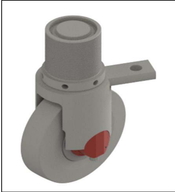
ISO View of Roller

DynaIndustrial's split yoke, high capacity forming rolls offer reduced bearing failures and efficient roll changes resulting in decreased maintenance costs.